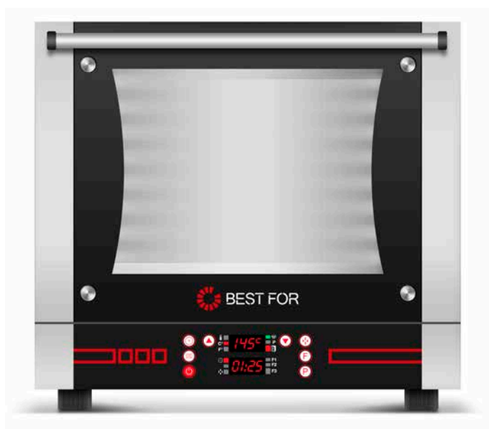
Snack 434 T digital