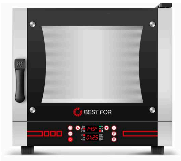
Snack 434 W digital